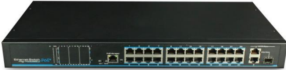
(SFP Fiber Optic Module Not Included)