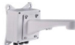
Wall Mount (with Termination Box)