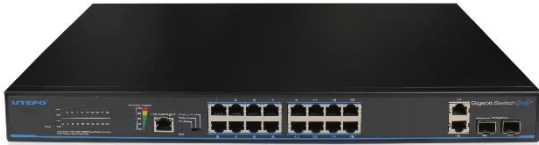
(SFP Fiber Optic Module Not Included)