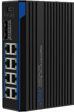
(SFP Fiber Optic Module Not Included)