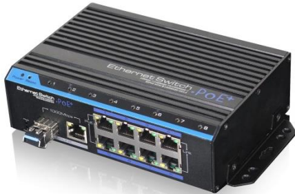
(SFP Fiber Optic Module Not Included)